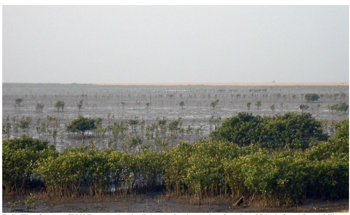
Beili Wan Sigeng (CN507) was recently discovered to be a wintering site of Black-faced Spoonbill Platalea minor .

IMPORTANCE TO OTHER FAUNA AND FLORA: No information.